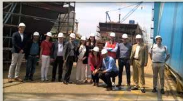
Fourth Partners Meeting (Vigo, July 2019).