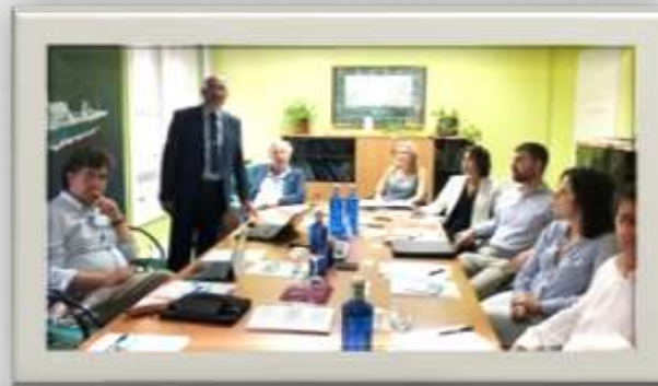
Shipbuilding ancillary industry companies meeting in FMV office (July 2020)