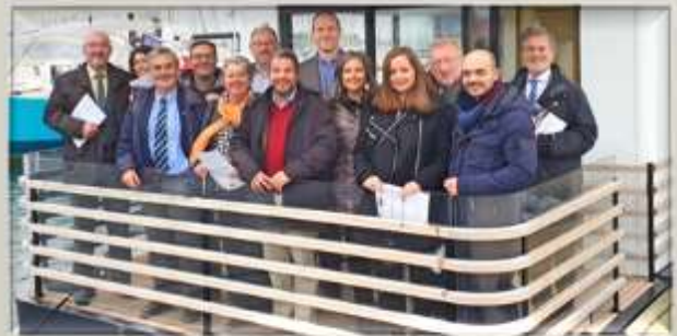
Third Partners Meeting (Lorient, December 2018).