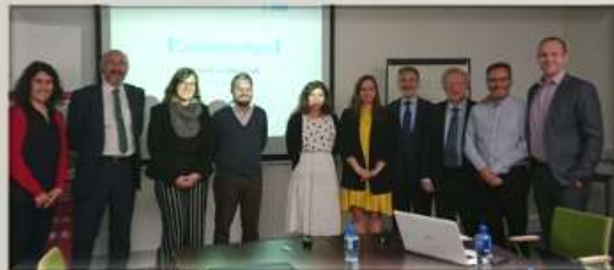
Second Partners Meeting (Cork, June 2018).