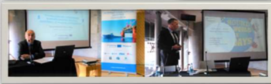
Dissemination event in Bilbao Maritime Museum (November 2019)