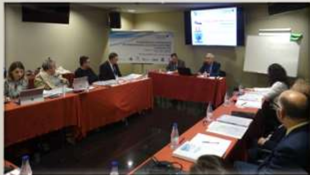
Kick-Off Meeting (Bilbao, November 2017).